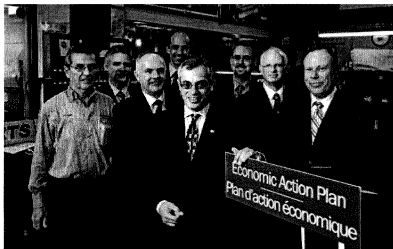
Minister of Industry Applauds Voluntary

Accord on Access to Vehicle Repair Information September 29, 2009